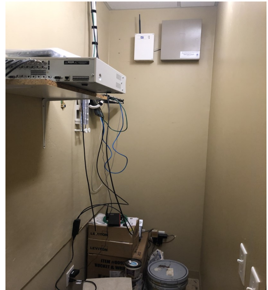
Technology Closet in Office