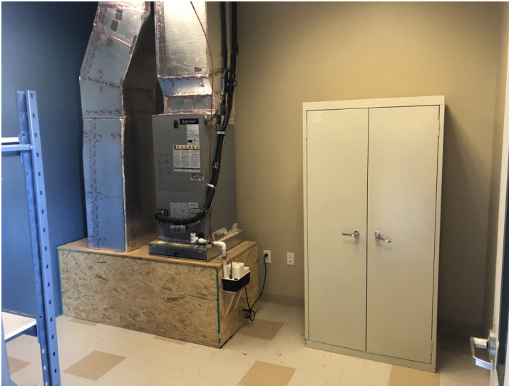
Mechanical Room in Warehouse