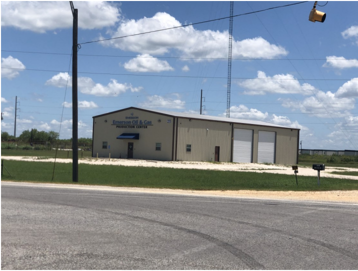
View from Highway 72