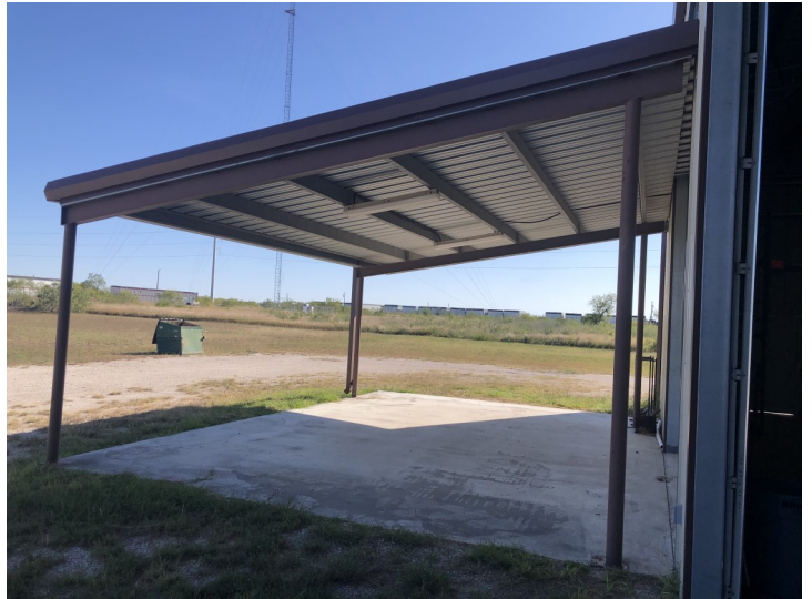
20' x 30' Canopy