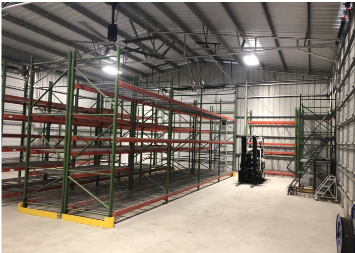
Warehouse Interior (shelving included)