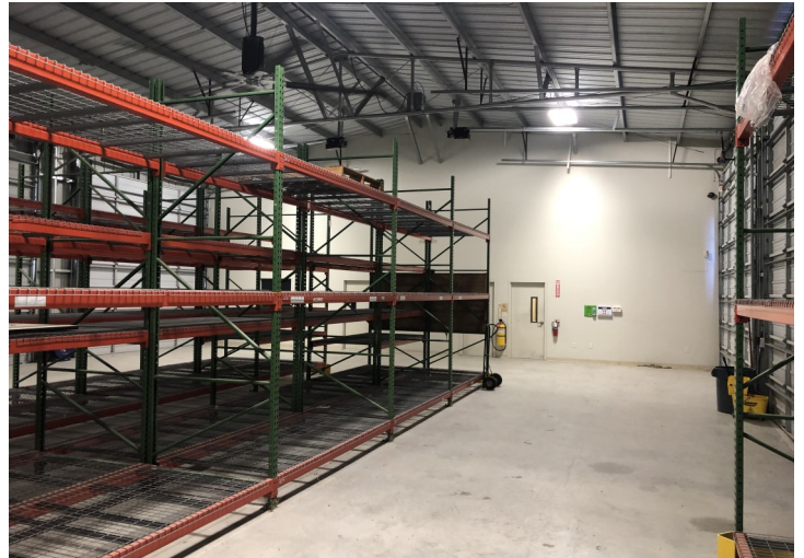
Warehouse Interior (shelving included)