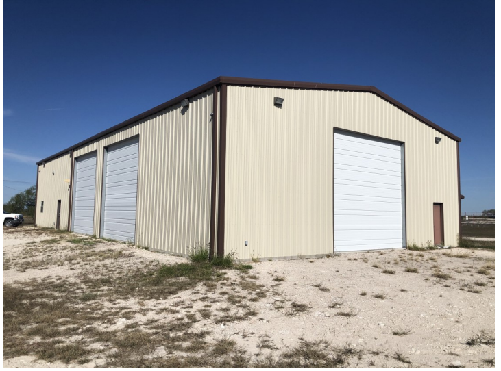
Rear/Side View of Building