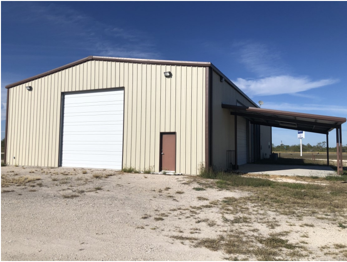
Rear View of Building